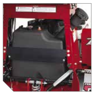
Generous 7.75-gallon fuel tank is centrally located for consistent balance, and the fuel filler neck is conveniently located on the side for easy filling.