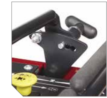
The easy locking 3-position speed control setting is conveniently located and requires no tools to facilitate smooth operation in a wide range of conditions.