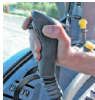
Control with circuit selector (standard equipment on RP models)