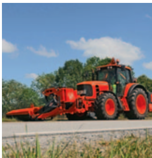
Front-mounted version for big jobs