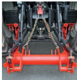
STABI-LINK® quick-fit frame